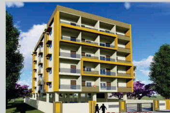
Hasini Elite, Bheemunipatnam