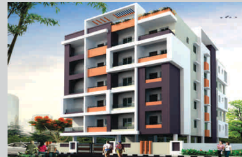
Hasini Paradise, Bheemunipatnam