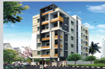
Hasini Heights, Bheemunipatnam